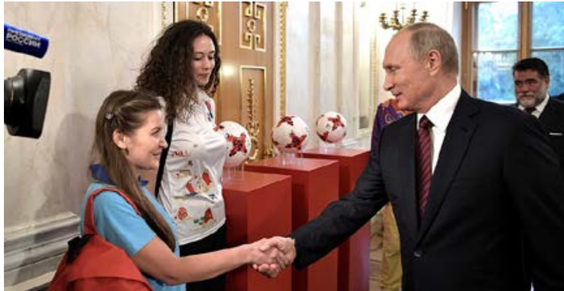
Joint meeting of the Council for the Development of Physical Culture and Sport and the 2018 FIFA World Cup Russia Local Organising Committee's Supervisory Board.