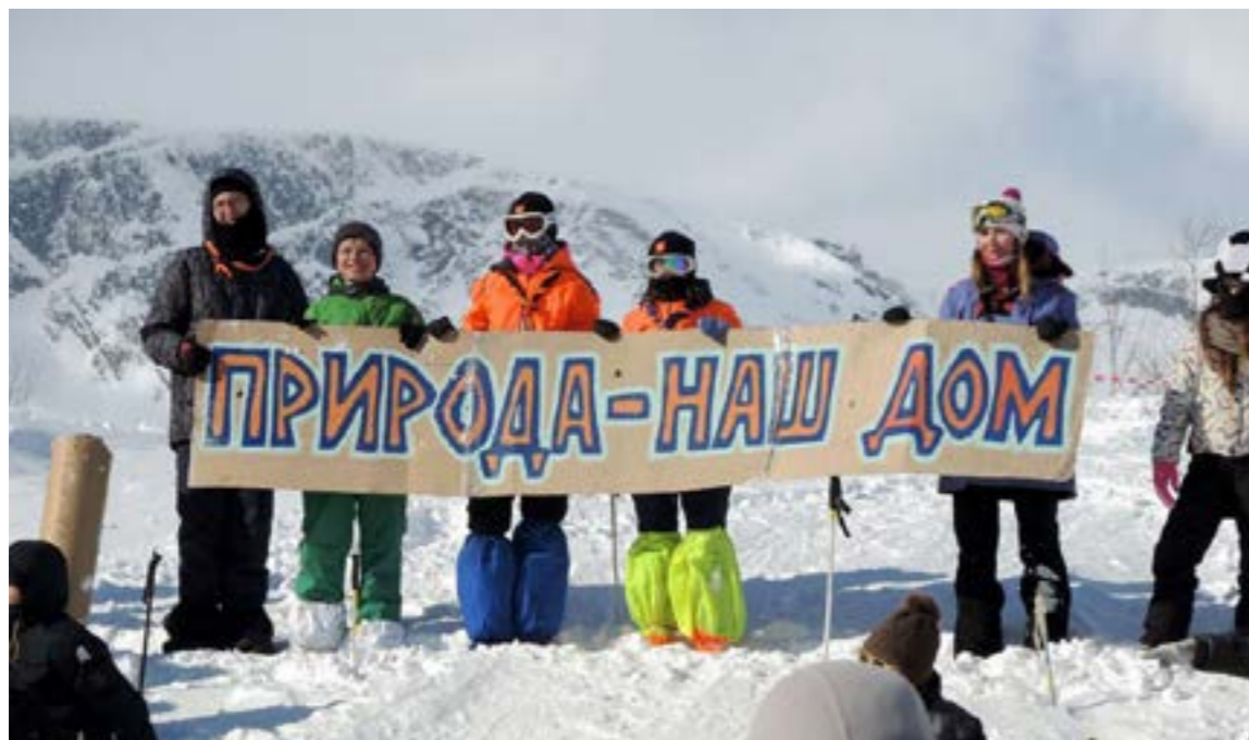
Support for a national park in Khibiny mountains.

By: Kjersti Album and Daniella Slabinski